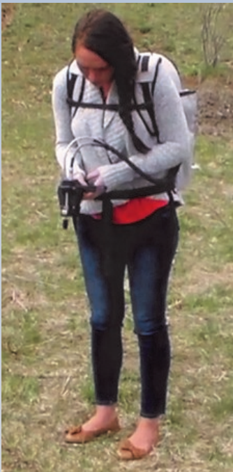
The SR-8800 goes in a backpack and can be equipped with a unique, custom pistol grip to take all the measurements required for field work.

The SR-8800 with the Sensaprobe™ grip allows for consistent measurements by any user at any experience level to ensure that measurements are taken correctly in the field for research applications. See exactly what you are scanning with the embedded camera. It can also be used for vicarious calibration to validate satellite or flyover hyperspectral and multispectral data being used in research.