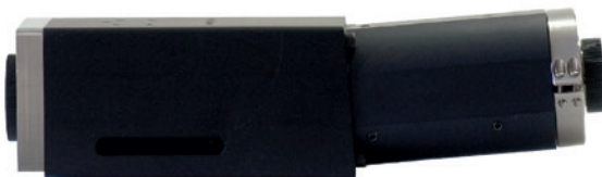
ImSpector N17E spectrograph, side view