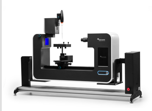
Theta Flow with the Tilting cradle (C204A)