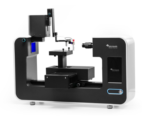
Theta Flow with the Automatic picoliter dispenser (T315A)