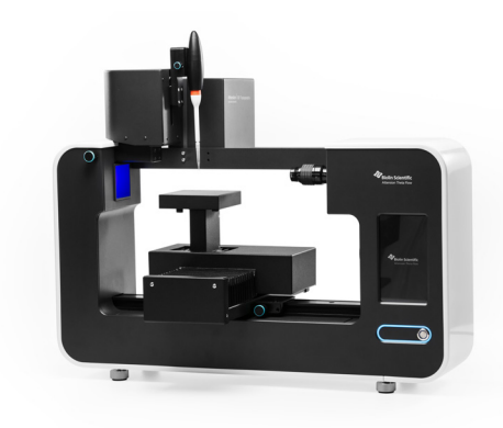
Attension Theta Flow with the 3D Topography module (T316)

Eccentric needle for HPC, enabling placing multiple contact angle droplets with a single loading.