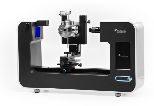
Attension Theta Flow with the High Pressure chamber (T317)

Needle for HPC, gauge 14 (T317E-14) Needle for HPC, gauge 22 (T317G-22) Needle for HPC, gauge 30 (T317H-30)