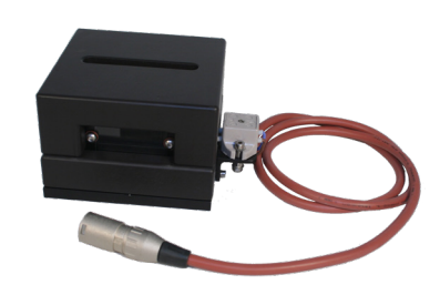
Measuring chamber, electrically heated (C203E)