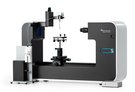
Attension Theta Flex with the Pulsating drop module (T214)

Sample holder for single fibers to make picoliter drop placing easier. Adjustable length option for the fiber ranging from 25 mm to 75 mm.