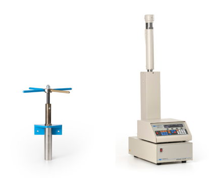
Manual pump for HPC (T317C)

Needle for HPC, gauge 14 (T317E-14) Needle for HPC, gauge 22 (T317G-22) Needle for HPC, gauge 30 (T317H-30)