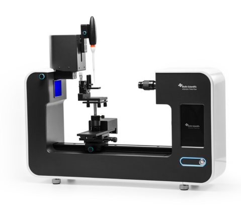
Theta Flow with the Tilting stage (C218)