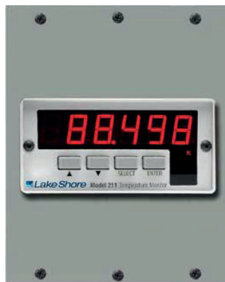
2111 Single 1/4 DIN panel-mount adapter, 105 mm W \times 132 mm H (4.1 in \times 5.2 in)