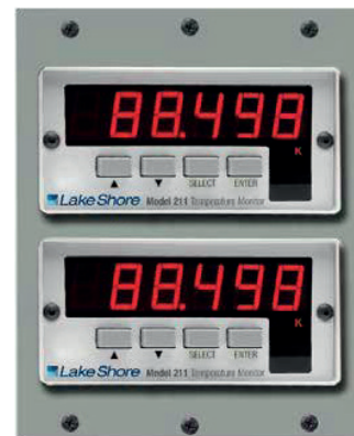
2112 Dual 1/4 DIN panel-mount adapter, 105 mm W \times 132 mm H (4.1 in \times 5.2 in)