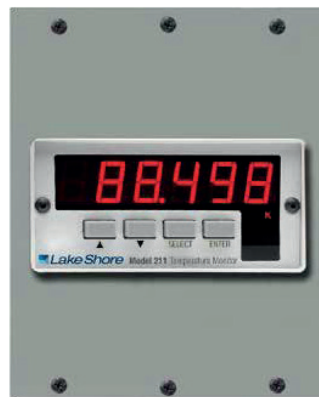
2111 Single 1/4 DIN panel-mount adapter, 105 mm W \times 132 mm H (4.1 in \times 5.2 in)