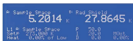
Two input/output display with labels Reading locations can be user configured to meet application needs. Here, the input name is shown above each measurement reading along with the designated input letter.