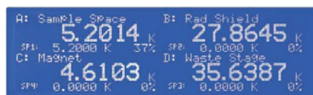
Four input/output display with labels Standard display option featuring all four inputs and associated outputs.

The ±10 V analog voltage outputs on outputs 3 and 4 can be configured to send a voltage proportional to temperature to a strip chart recorder or data acquisition system. You may select the scale and data sent to the output, including temperature or sensor units.