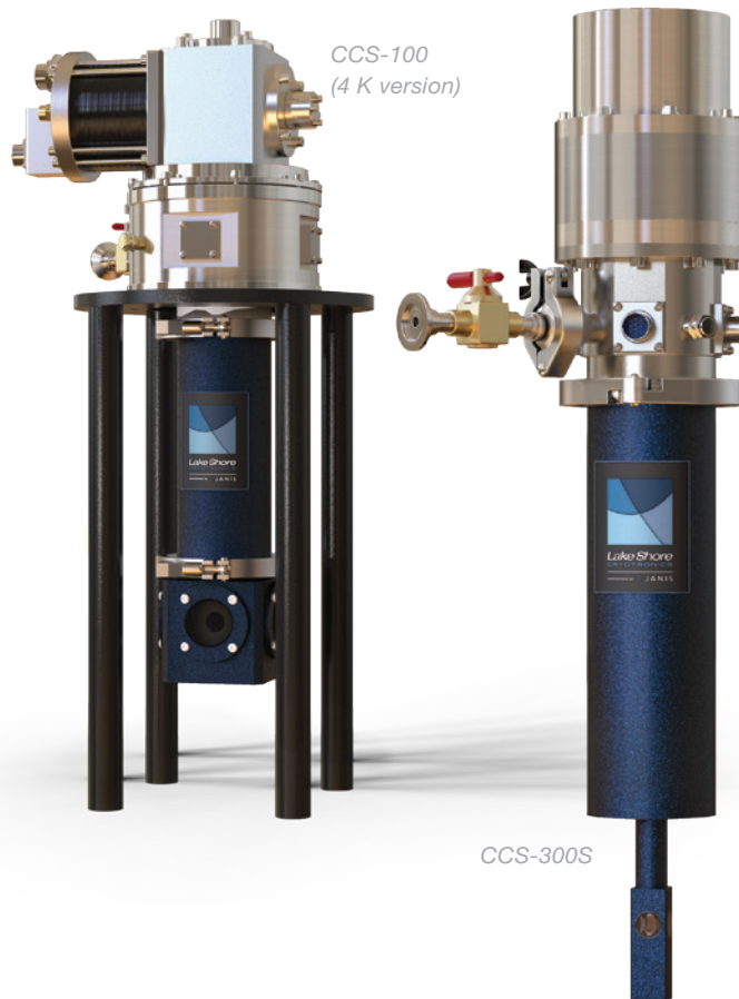
CCS-100 (4 K version)

The Lake Shore M81-SSM provides highly synchronized DC, 100 kHz AC, and mixed DC + AC sourcing and measuring—including both voltage and current lock-in measurement capabilities—for low-temperature material research performed in your cryostat. It supports up to three remote-mountable source and three measure modules per a single M81-SSM-6 instrument and, owing to its modularity, allows signal and source amplifiers to be located as close as possible to the sample being characterized. This minimizes the signal wiring to the sample, reduces noise, and increases measurement sensitivity.