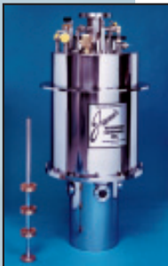
Cryostat for Scanning Probe/Force Microscopy