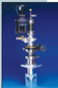
FTIR Cryostat with Motorized Sample Manipulation

The SuperTran-VP series (STVP) provides sample in vapor cooling from 1.5 K to 300 K and higher, and includes a top loading sample probe. Rapid sample changes are possible, and samples with poor thermal characteristics (i.e., liquids and powders) or irregular shapes can easily be cooled. Application specific models include NMR, ESR and FTIR.