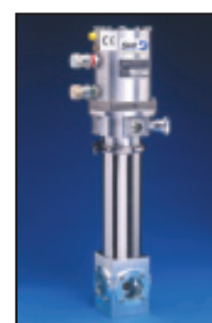
Original APD Cryogenics Cryocoolers

Janis Research CCR designs begin with cryocoolers supplied by several of the world's leading manufacturers of cryogenic refrigerators. Unlike most other cryostat manufacturers, Janis Research is not restricted to a single cryocooler supplier, and can therefore suggest the most suitable cryocooler for any particular application. Janis Research has designed and built CCR systems for an extremely broad range of applications including VSM, Mössbauer, matrix isolation, Hall measurements, microwave device cooling, detector cooling, x-ray and neutron diffraction, and many more. Temperature ranges are available from 7 K to 800 K.