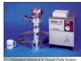
Compact Optical 4 K Closed Cycle System

Janis Research 4 K CCR designs can be used as a direct replacement for liquid helium cooled systems. Depending upon the cost of liquid helium and hours of operation, typical annual cost savings can range from $5,000 to $50,000 or more. Janis Research offers a broad range of 4 K CCR systems, with cooling powers ranging from 0.1 to 1.5 watts @ 4.2 K. In addition to complete cold finger and exchange gas cooled cryostats, bare 4 K cryocoolers can be provided for use in cryostat shield cooling, helium recondensing, astronomical applications and more.