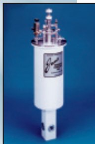
High Efficiency Variable Temperature Reservoir Cryostat

Other reservoir cryostat models include the VariTemp system, available in either static helium gas or vacuum sample environment, and VSRD helium vapor shielded research dewars for use in conjunction with superconducting magnets, variable temperature probes, and ultra low temperature inserts.