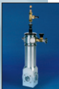
Liquid Nitrogen Pourfill Reservoir Cryostat

The VNF sample in flowing vapor cryostat is ideal for liquid or powder samples, which are difficult to thermally anchor in a conventional cold finger cryostat. The top loading sample positioner permits quick sample change without warming the cryostat. Like the VPF cryostat, the VNF can be equipped with compact tails for use with narrow gap magnets.