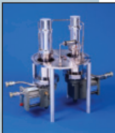
Mechanically Cooled Cryogenic Cold Trap