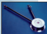
Low Vibration Microscopy Cryostat