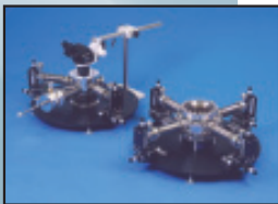
Micro-manipulated Probe Stations