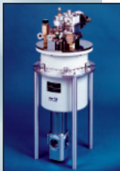
Top Loading 4 K Closed Cycle System