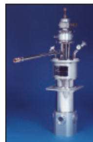
Sample in Vapor Continuous Flow Cryostat