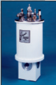
Optical Split Pair Magnet