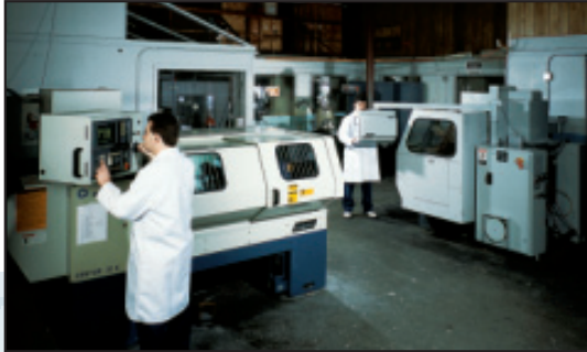
Janis Research Manufacturing Facility

Incorporated in 1961, Janis Research Company, Inc. is recognized as one of the foremost suppliers of cryogenic equipment in the world. Through the years, Janis Research has been continually dedicated to the design, fabrication and delivery of the best systems and components in the industry. Using state-of-the-art CAD/CAM systems, Janis Research has developed the broadest range of cryogenic products in the business. With an installed base of over 8,000 systems and a staff of highly skilled scientists, Janis Research has the experience and the expertise to supply the system best suited to meet your cryogenic requirements.