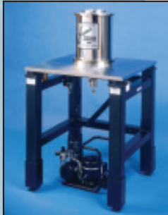
Vibration-isolated Continuous Flow Probe Cryostat