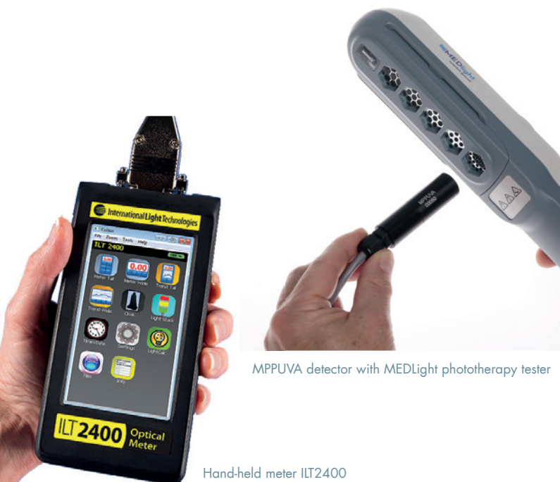
MPPUVA detector with MEDLight phototherapy tester