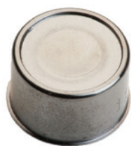
DuraBeryllium x-ray window