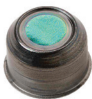
DuraBeryllium plus x-ray window