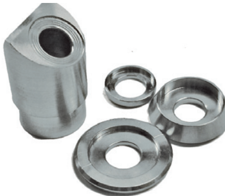
Figure 3 Sample window mounts

AP windows are bonded to a metal mount using a vacuum compatible adhesive.