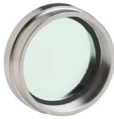
Figure 2: AP5 X-ray window