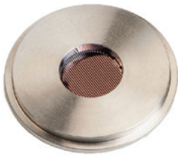
Figure 1: AP3 X-ray window