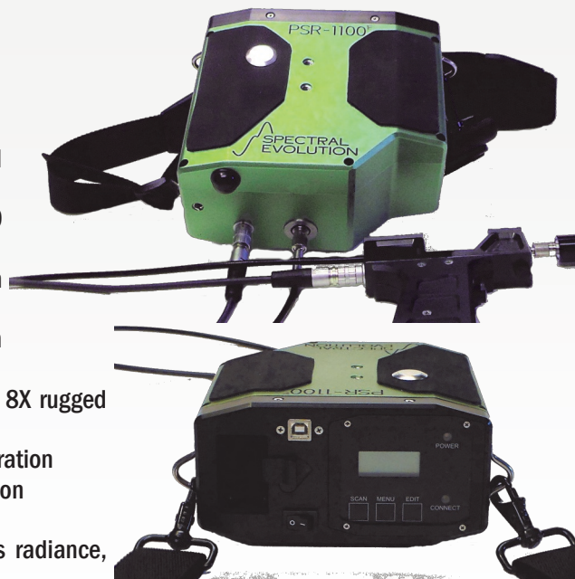
PSR-1100 r has a built-in LCD screen and keypad and can store up-to 2500 scans.